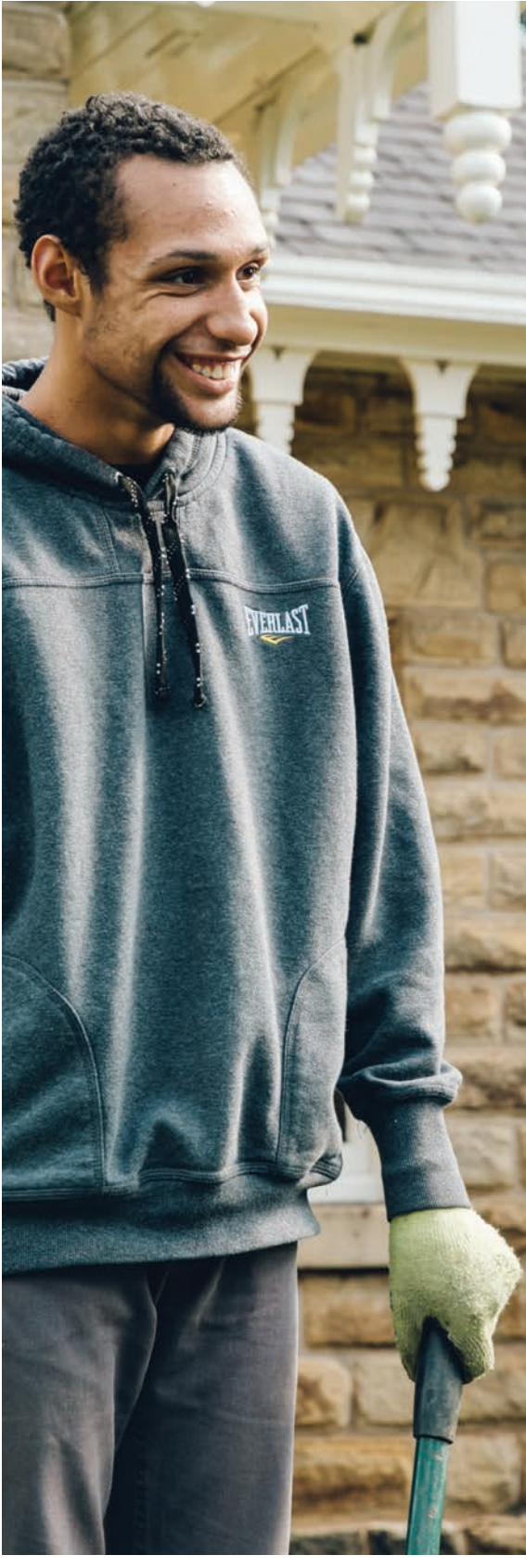
For more information go to www.sheffield.gov.uk/ localoffer

The best thing to do is to come and meet us, have a look around and discuss your support needs with staff at The Sheffield College. To arrange your one-to-one simply contact The Sheffield College (see back page).